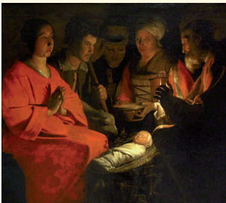
■ The Adoration of the Shepherds by Georges de La Tour, circa 1645