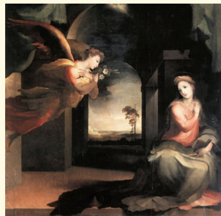
■ The Annunciation by Domenico di Pace Beccafumi, circa 1545