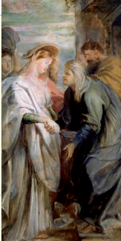
■ Visitation by Peter Paul Rubens, 1611-1612