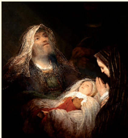
■ Simeon's Song of Praise by Aert de Gelder, between 1700-1710