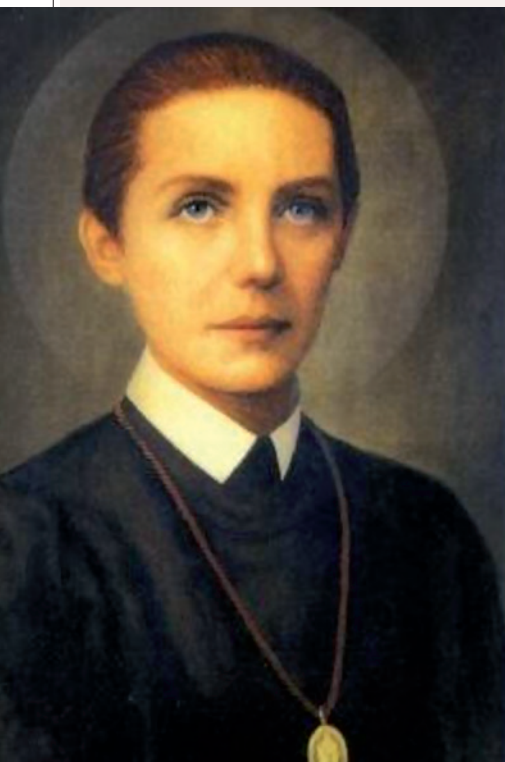
■ Bl Maria Teresa Ledóchowska

How did it come about that a lady-in-waiting in the royal court in Salzburg became known as the “Mother of Africa”?