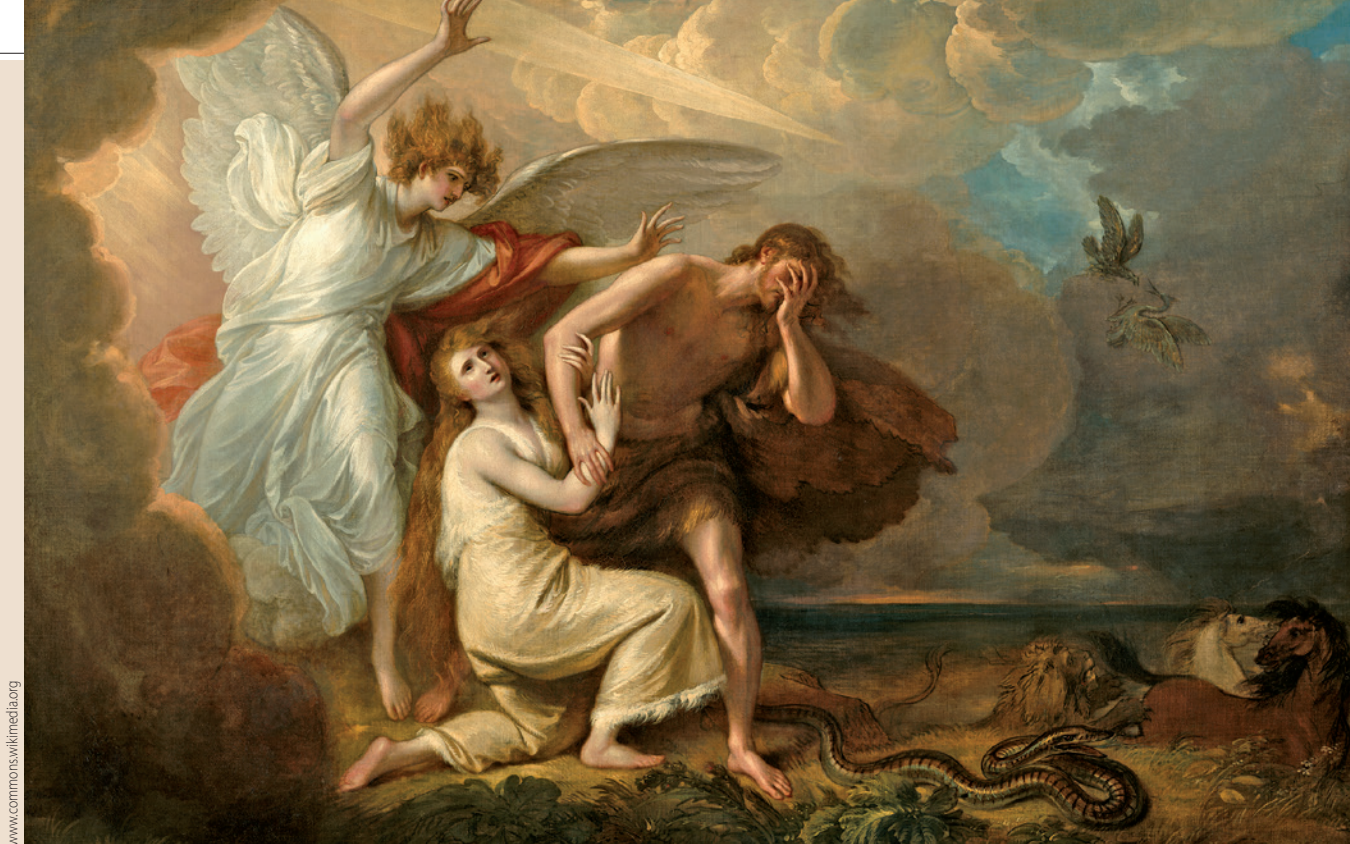
■ The Expulsion of Adam and Eve from Paradise by Benjamin West, 1791