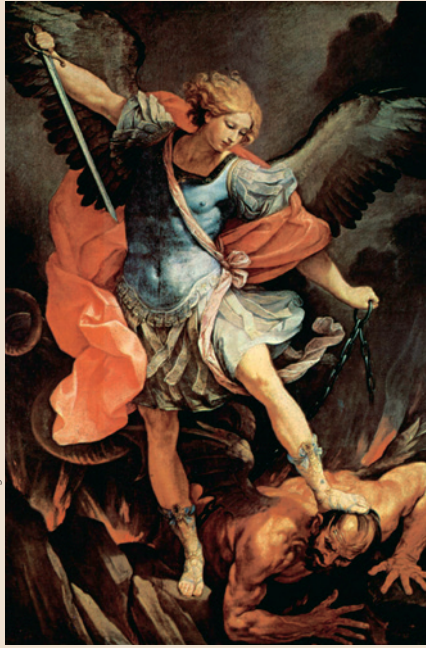
■ St Michael Archangel by Guido Reni, 1636