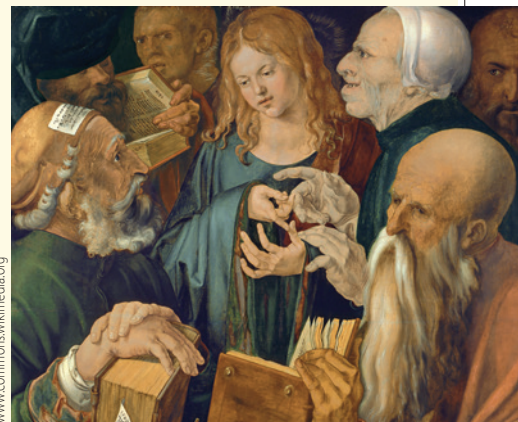
■ Jesus among the Doctors by Albrecht Dürer, 1506