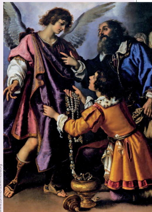
■ The Archangel Raphael refusing Tobias’ gift by Giovanni Biliverti, 1612.

Note that Raphael called the two men privately and said to them: “Praise God and give thanks to Him; exalt Him and give thanks to Him in the presence of all the living for what He has done for you. It is good to praise God and to exalt His Name, worthily declaring the works of God, and with fitting honour to acknowledge Him. Do not be slow to give Him thanks. It is good to guard the secret of a king, but gloriously to reveal the works of God, and with fitting honour to acknowledge Him. Do good, and evil will not overtake you. Prayer is good when accompanied by fasting, almsgiving, and righteousness. A little with righteousness is better than much with wrongdoing. It is better to give alms than